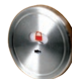
TLA 421 Privacy with indicator